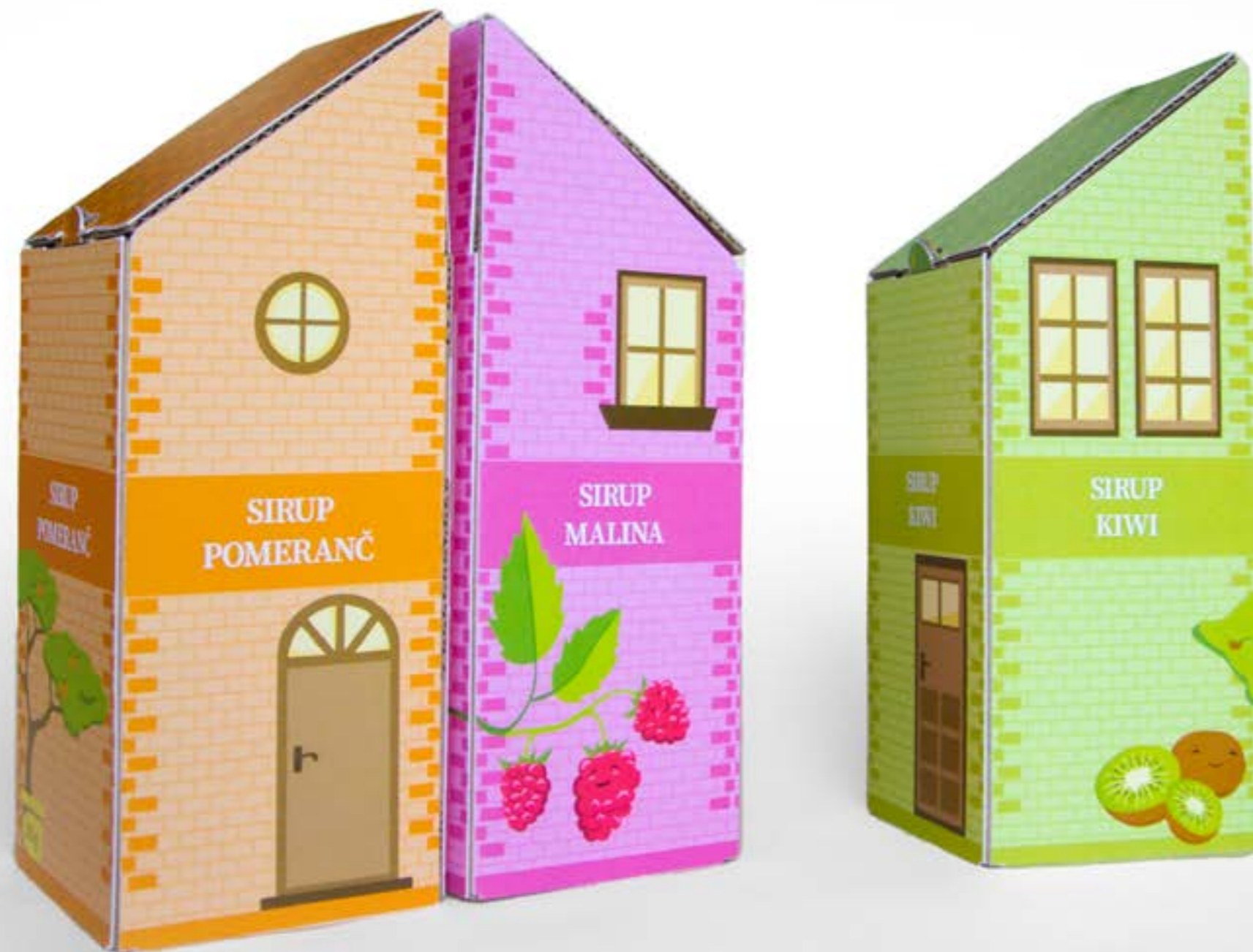
SYRUP PACKAGING FOR KIDS